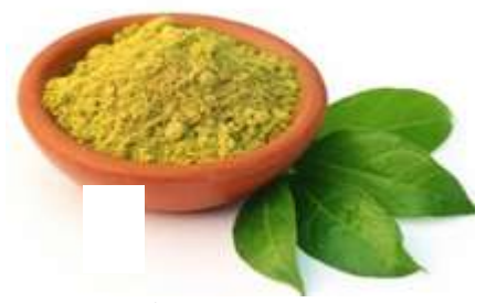
Fig No. 1- Heena

Chemical constituents :- flavonoids, gallich acid, lawsone, Carbohydrates, terpenedo, flavonoids.