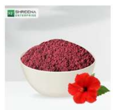
Fig No. 6- Hibiscus

It is used to prevent premature greying of hair. It is rich in vitamins and antioxidants. (10)