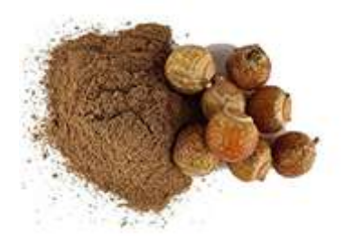
Fig No. 4- Reetha

Reetha stimulate better hair growth. It act as foaming agent. It show anti-dandruff activity. It use as hair tonic. (14)