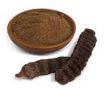
Fig No. 5- Shikakai

Application :-It is antidandruff agent. It foaming and cleaning agent. (15)