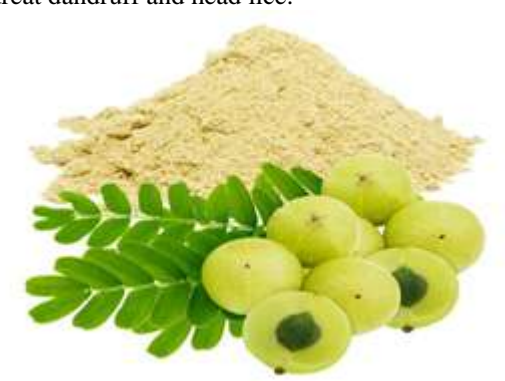
Fig No. 3- Amla

Amla improve the tone of hair dyes. It promotes healthy hair growth. It condition scalp. It minimize grays. It boost volume of hair. It treat dandruff and head lice. (6)