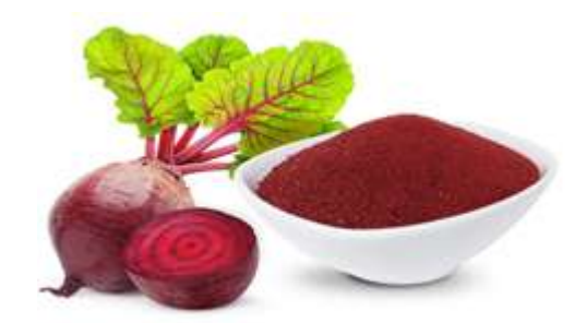
Fig No. 2- Beet Root

Beet root prevent air. It strengthen follicle's. Use to treat dandruff.